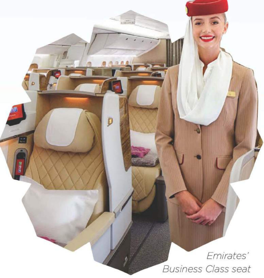
Fly in style with Emirates Airbus A380 Business Class